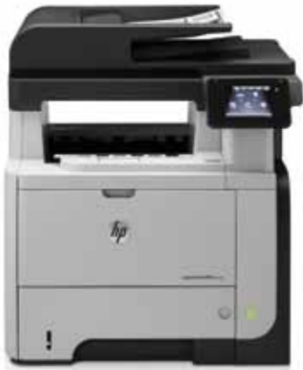
HP LaserJet Pro MFP M521dw

Finish jobs faster, produce high-quality documents, and make scanning and sharing simple. Get set up and connected quickly. 3,9 Send quick commands from an intuitive color touchscreen. Easily conserve resources and recycle used cartridges. 11