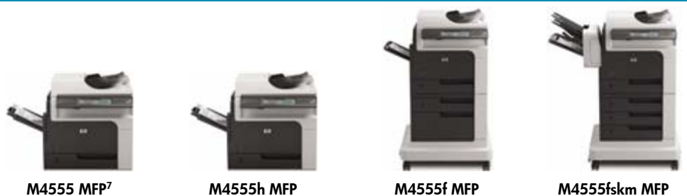
M4555 MFP 7