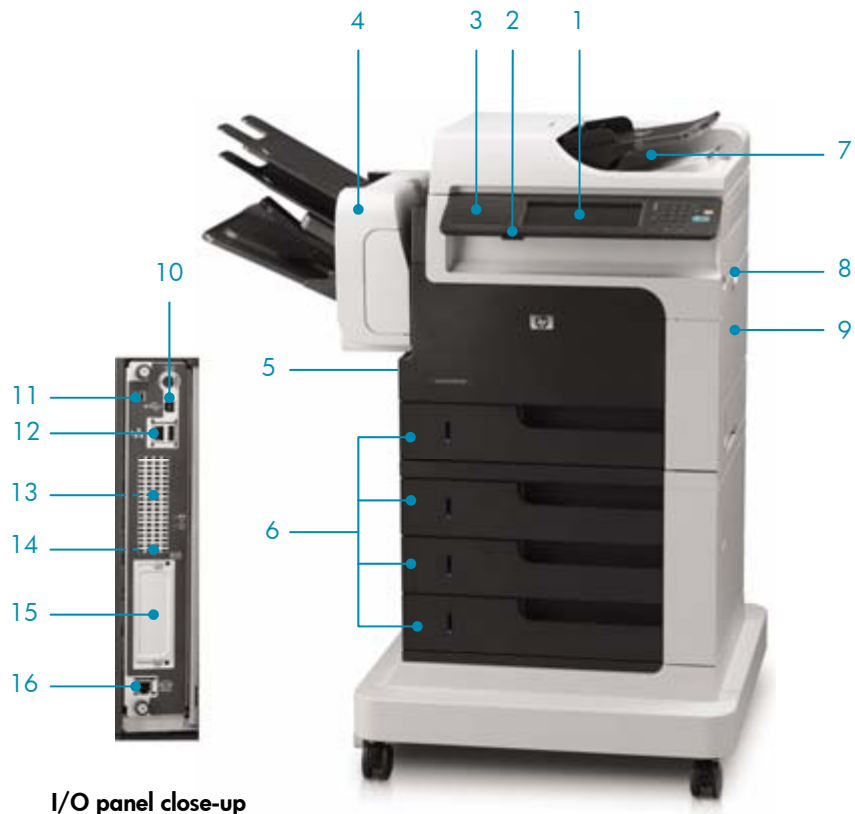
I/O panel close-up